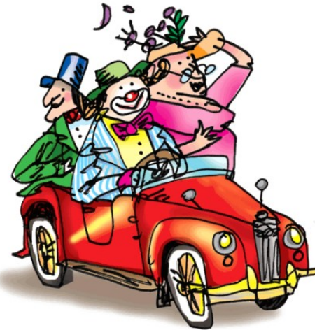
start the car

2. took , look , book , shook , cook , foot