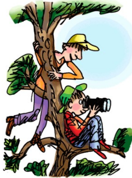
what can you see?

2. day , play , may , way , lay , say , tray , spray